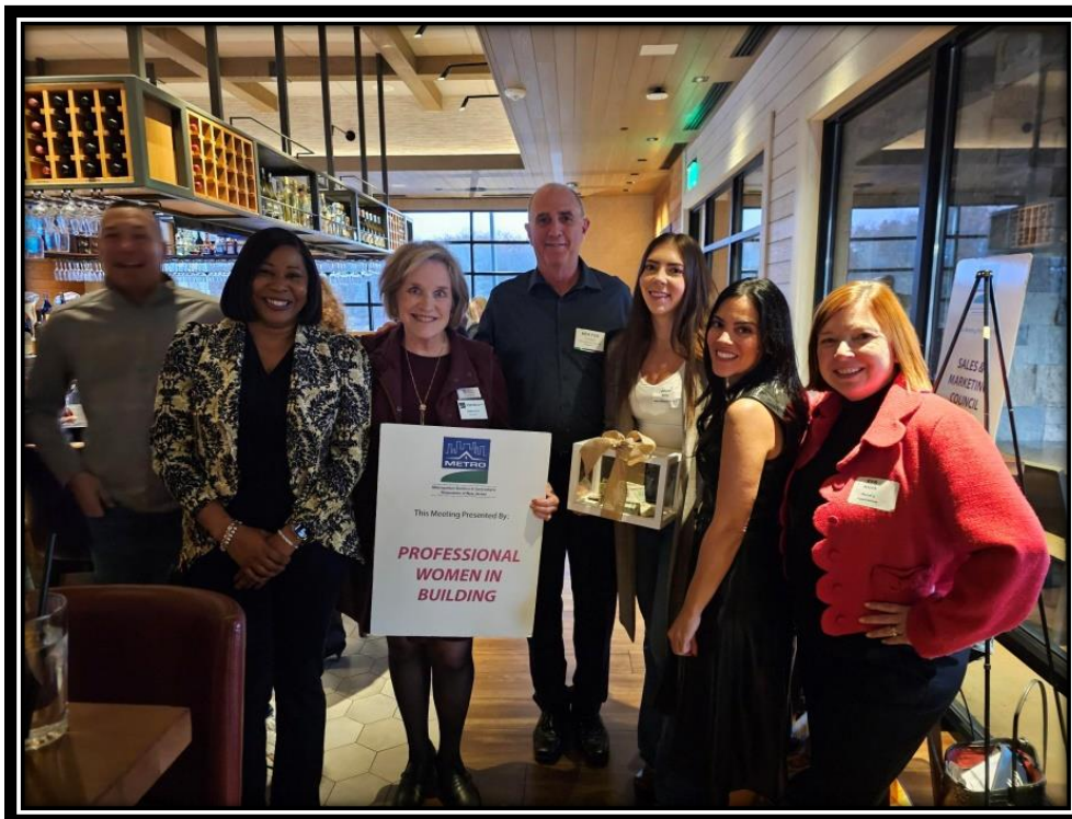
Our Metro PWB Team Members who were at our event!!!!